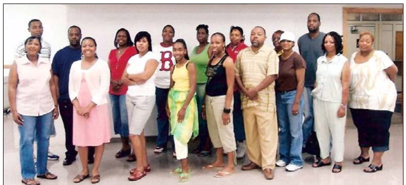
The East St. Louis Grow Your Own Teachers Cohort